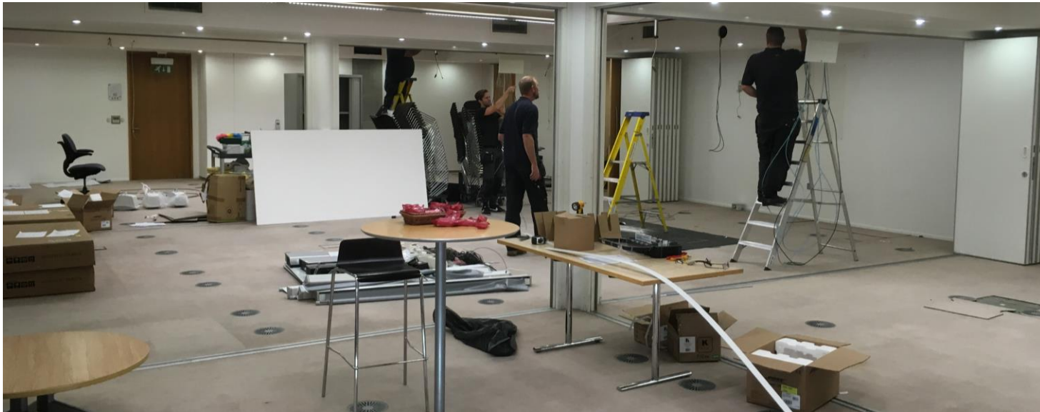
Behind the scenes of the AV Refurbishment